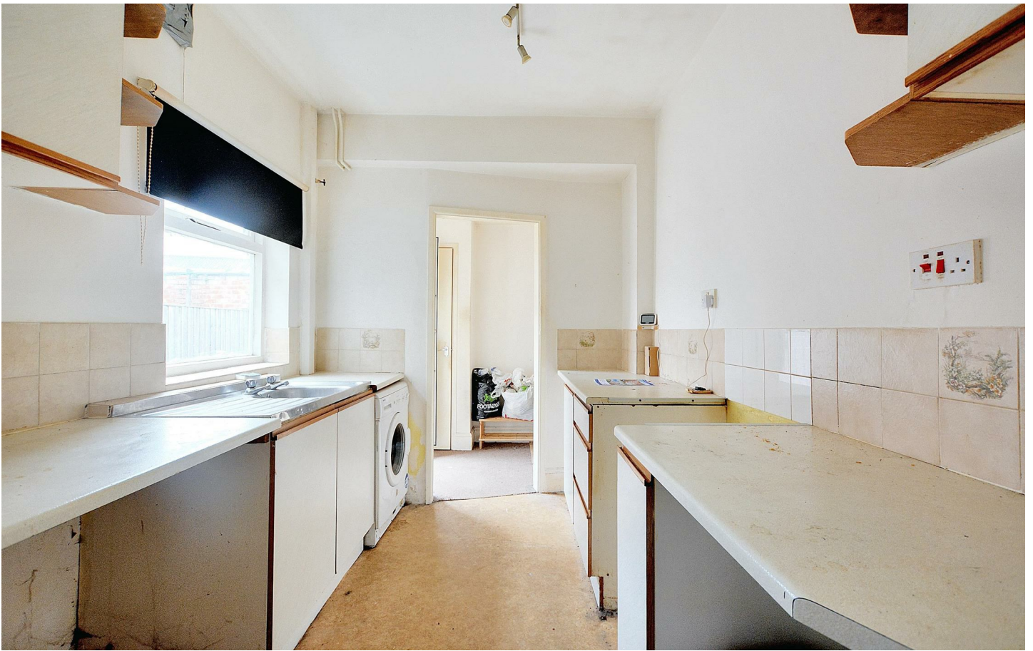
A TWO DOUBLE BEDROOM SEMI-DETACHED HOUSE WITH LOW MAINTENANCE REAR GARDEN, BEING SOLD WITH THE BENEFIT OF NO ONWARD CHAIN.

Robert Ellis are pleased to market this spacious two double bedroom semi-detached home, perfect for a wide range of buyers including first time buyers, investors, families and downsizers alike. The property is constructed of brick and benefits mostly double glazing and gas central heating throughout. An internal viewing is highly recommended.